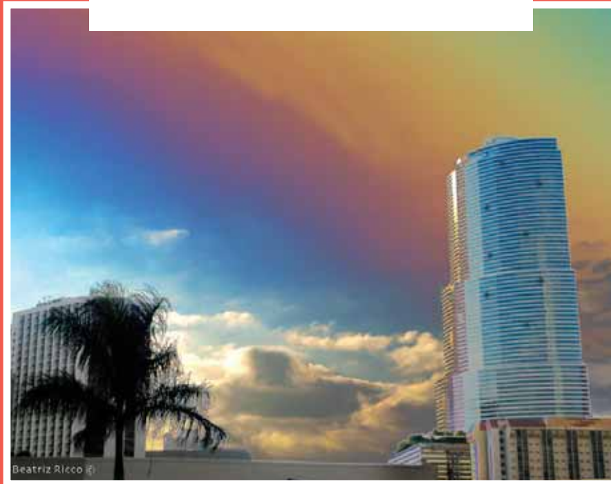
Exhibit Dates: May 8-9, 2007 Meeting Dates: May 6-10, 2007

A UNIQUE DOMESTIC AND INTERNATIONAL MARKETING OPPORTUNITY TO ACHIEVE YOUR ORGANIZATIONAL AND RESEARCH GOALS.